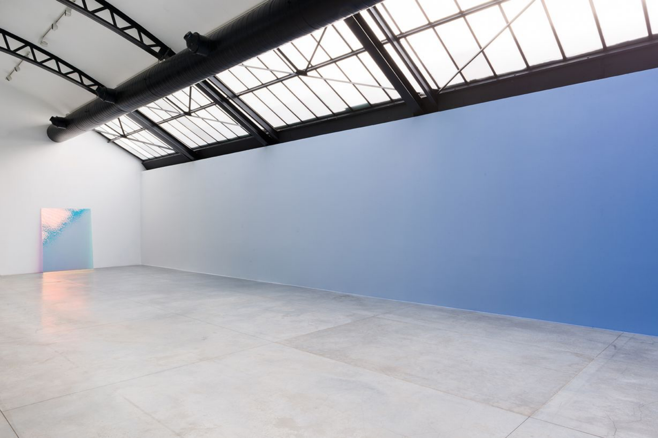
(Left) Ann Veronica Janssens, Frisson bleu , 2021. (Right) Pieter Vermeersch, Untitled , 2022.

Fondation CAB / 6 September 2022–28 January 2023 / Brussels, BE